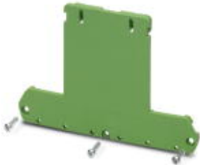
Side element, without foot, tall version, for 60 mm wide U-shaped cover.

Please be informed that the data shown in this PDF Document is generated from our Online Catalog. Please find the complete data in the user's documentation. Our General Terms of Use for Downloads are valid ( http://phoenixcontact.com/download )