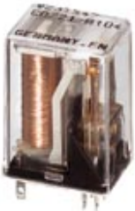
KAMMRELAIS ®, contact B 104, size 1, low-level contact, 2 PDTs, input voltage 24 V AC

Please be informed that the data shown in this PDF Document is generated from our Online Catalog. Please find the complete data in the user's documentation. Our General Terms of Use for Downloads are valid ( http://phoenixcontact.com/download )