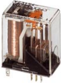
KAMMRELAIS ®, contact F 104, size 2, heavy-duty contact, 2 PDTs, input voltage 24 V AC

Please be informed that the data shown in this PDF Document is generated from our Online Catalog. Please find the complete data in the user's documentation. Our General Terms of Use for Downloads are valid ( http://phoenixcontact.com/download )