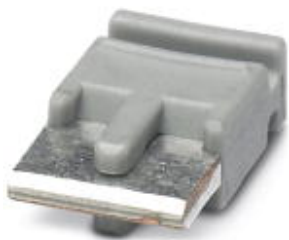
Single plug-in bridge, length: 6 mm, number of positions: 2, color: gray

Please be informed that the data shown in this PDF Document is generated from our Online Catalog. Please find the complete data in the user's documentation. Our General Terms of Use for Downloads are valid ( http://phoenixcontact.com/download )