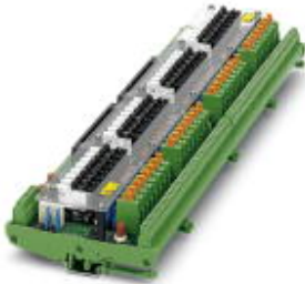
VARIOFACE output module, 32 channels for Yokogawa ADV 551, ADV 561 output modules.

Please be informed that the data shown in this PDF Document is generated from our Online Catalog. Please find the complete data in the user's documentation. Our General Terms of Use for Downloads are valid ( http://phoenixcontact.com/download )