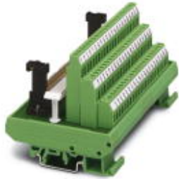
VARIOFACE module, for IEC 603/DIN 41612 connector, type C, 64-pos., a, c components mounted, with male connector, cable housing with screw interlock

Please be informed that the data shown in this PDF Document is generated from our Online Catalog. Please find the complete data in the user's documentation. Our General Terms of Use for Downloads are valid ( http://phoenixcontact.com/download )