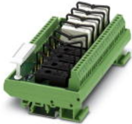
VARIOFACE module, for 8 plug-in miniature relays or miniature optocouplers, with LED, 5 V DC input voltage

Please be informed that the data shown in this PDF Document is generated from our Online Catalog. Please find the complete data in the user's documentation. Our General Terms of Use for Downloads are valid ( http://phoenixcontact.com/download )