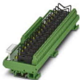
VARIOFACE module, for 16 plug-in miniature relays or miniature optocouplers, with LED, 24 V DC input voltage

Please be informed that the data shown in this PDF Document is generated from our Online Catalog. Please find the complete data in the user's documentation. Our General Terms of Use for Downloads are valid ( http://phoenixcontact.com/download )