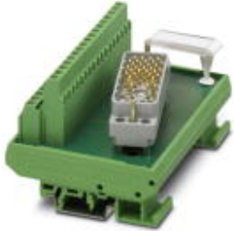
VARIOFACE module, for ELCO connector, for mounting on NS 35/7.5 or NS 32, with pin strip 8016 left, no. of positions 32

Please be informed that the data shown in this PDF Document is generated from our Online Catalog. Please find the complete data in the user's documentation. Our General Terms of Use for Downloads are valid ( http://phoenixcontact.com/download )