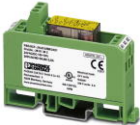
Universal safety relay with forcibly guided contacts, two PDT contacts, for U_N 120 V AC/DC

Please be informed that the data shown in this PDF Document is generated from our Online Catalog. Please find the complete data in the user's documentation. Our General Terms of Use for Downloads are valid ( http://phoenixcontact.com/download )