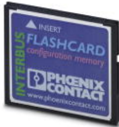
Program and configuration memory, plug-in, 256 MB

Please be informed that the data shown in this PDF Document is generated from our Online Catalog. Please find the complete data in the user's documentation. Our General Terms of Use for Downloads are valid ( http://download.phoenixcontact.com )