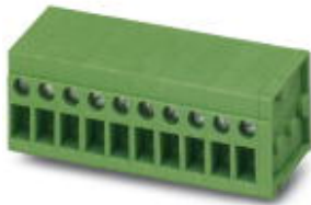
The illustration shows the 10-position version

Please be informed that the data shown in this PDF Document is generated from our Online Catalog. Please find the complete data in the user's documentation. Our General Terms of Use for Downloads are valid ( http://phoenixcontact.com/download )