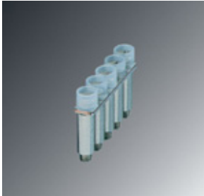
Fixed bridge, number of positions: 5, color: silver

Please be informed that the data shown in this PDF Document is generated from our Online Catalog. Please find the complete data in the user's documentation. Our General Terms of Use for Downloads are valid ( http://phoenixcontact.com/download )