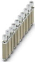
Isolator bridge bar, for switchable cross bridges, with insulating collar, pitch: 8.2 mm, number of positions: 10, color: silver

Please be informed that the data shown in this PDF Document is generated from our Online Catalog. Please find the complete data in the user's documentation. Our General Terms of Use for Downloads are valid ( http://phoenixcontact.com/download )