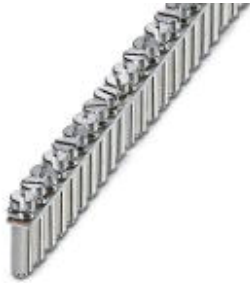
Fixed bridge, number of positions: 20, color: silver

Please be informed that the data shown in this PDF Document is generated from our Online Catalog. Please find the complete data in the user's documentation. Our General Terms of Use for Downloads are valid ( http://phoenixcontact.com/download )