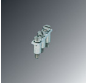
Fixed bridge, number of positions: 3, color: silver

Please be informed that the data shown in this PDF Document is generated from our Online Catalog. Please find the complete data in the user's documentation. Our General Terms of Use for Downloads are valid ( http://phoenixcontact.com/download )