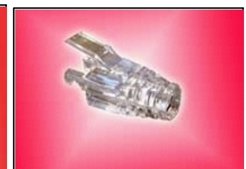
CXB500/600 Snagless Boot