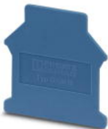
End cover, length: 42.5 mm, width: 1.5 mm, height: 54 mm, color: blue

Please be informed that the data shown in this PDF Document is generated from our Online Catalog. Please find the complete data in the user's documentation. Our General Terms of Use for Downloads are valid ( http://phoenixcontact.com/download )