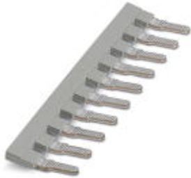
Insertion bridge, pitch: 12 mm, number of positions: 10, color: gray

Please be informed that the data shown in this PDF Document is generated from our Online Catalog. Please find the complete data in the user's documentation. Our General Terms of Use for Downloads are valid ( http://phoenixcontact.com/download )