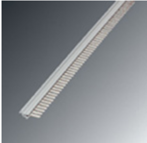
Plug-in bridge, pitch: 5.2 mm, number of positions: 80, color: gray

Please be informed that the data shown in this PDF Document is generated from our Online Catalog. Please find the complete data in the user's documentation. Our General Terms of Use for Downloads are valid ( http://phoenixcontact.com/download )