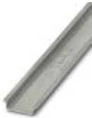
DIN rail, material: Aluminum, unperforated, height 7.5 mm, width 35 mm, length: 2 m

DIN rail - NS 35/ 7,5 AL UNPERF 2000MM - 0801704