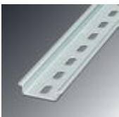
DIN rail, material: Galvanized, perforated, height 7.5 mm, width 35 mm, length: 2 m

DIN rail - NS 35/ 7,5 ZN PERF 2000MM - 1206421