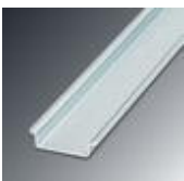
DIN rail, material: Galvanized, unperforated, height 7.5 mm, width 35 mm, length: 2 m

DIN rail - NS 35/ 7,5 ZN UNPERF 2000MM - 1206434