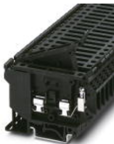
Fuse terminal block for cartridge fuse insert, cross section: 0.2 - 4 mm 2 , AWG: 26 - 10, width: 8.2 mm, color: Gray

Please be informed that the data shown in this PDF Document is generated from our Online Catalog. Please find the complete data in the user's documentation. Our General Terms of Use for Downloads are valid ( http://phoenixcontact.com/download )