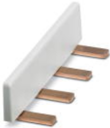
Insertion bridge, pitch: 17.8 mm, number of positions: 4, color: light gray

Please be informed that the data shown in this PDF Document is generated from our Online Catalog. Please find the complete data in the user's documentation. Our General Terms of Use for Downloads are valid ( http://phoenixcontact.com/download )