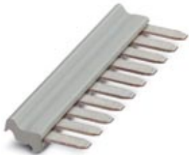
Bridge for potential distribution

Please be informed that the data shown in this PDF Document is generated from our Online Catalog. Please find the complete data in the user's documentation. Our General Terms of Use for Downloads are valid ( http://phoenixcontact.com/download )