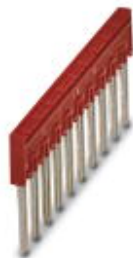
Plug-in bridge, pitch: 6.2 mm, number of positions: 10, color: red

Please be informed that the data shown in this PDF Document is generated from our Online Catalog. Please find the complete data in the user's documentation. Our General Terms of Use for Downloads are valid ( http://phoenixcontact.com/download )