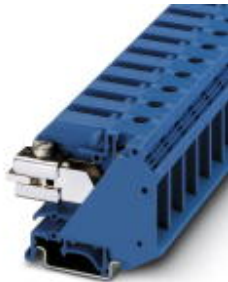
N disconnect terminal block, Special and hybrid connection, Cross section: 0.75 mm 2 - 35 mm 2 , AWG: 18 - 2, Width: 15 mm, Color: blue, Mounting type: NS 35/7,5, NS 35/15, NS 32

Please be informed that the data shown in this PDF Document is generated from our Online Catalog. Please find the complete data in the user's documentation. Our General Terms of Use for Downloads are valid ( http://download.phoenixcontact.com )