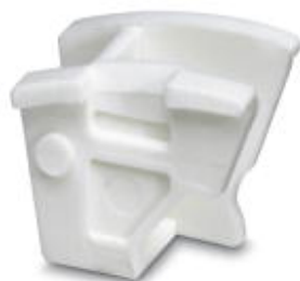
Switching lock, length: 12 mm, width: 8.2 mm, color: white

Please be informed that the data shown in this PDF Document is generated from our Online Catalog. Please find the complete data in the user's documentation. Our General Terms of Use for Downloads are valid ( http://phoenixcontact.com/download )