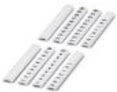
Zack Marker strip, flat, Strip, white, labeled, Printed horizontally: Consecutive numbers 1 - 10, 11 - 20, etc. up to 491 - 500, Mounting type: Snap into flat marker groove, for terminal block width: 5 mm, Lettering field: 5.15 x 5.15 mm

Zack Marker strip, flat - ZBF 5,LGS:FORTL.ZAHLEN - 0808671