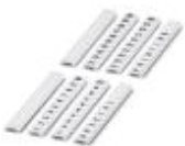
Zack Marker strip, flat, can be ordered: Strip, white, labeled according to customer specifications, Mounting type: Snap into flat marker groove, for terminal block width: 5 mm, Lettering field: 5.15 x 5.15 mm

Zack Marker strip, flat - ZBF 5 CUS - 0825025