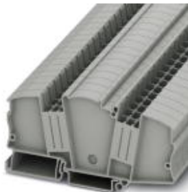
Spacer plate, length: 100.8 mm, width: 8.2 mm, color: gray

Please be informed that the data shown in this PDF Document is generated from our Online Catalog. Please find the complete data in the user's documentation. Our General Terms of Use for Downloads are valid ( http://phoenixcontact.com/download )