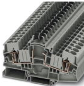
Component terminal block, with integrated P1000M diode, connection method: Spring-cage connection, cross section: 0.2 mm 2 - 10 mm 2 , AWG: 24 - 10, width: 8.2 mm, color: gray

Please be informed that the data shown in this PDF Document is generated from our Online Catalog. Please find the complete data in the user's documentation. Our General Terms of Use for Downloads are valid ( http://phoenixcontact.com/download )