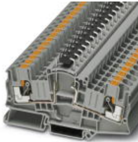
Component terminal block, Connection method: Push-in connection, Cross section: 0.5 mm 2 -10 mm 2 , AWG: 20 - 10, Width: 8.2 mm, Color: gray

Please be informed that the data shown in this PDF Document is generated from our Online Catalog. Please find the complete data in the user's documentation. Our General Terms of Use for Downloads are valid ( http://download.phoenixcontact.com )