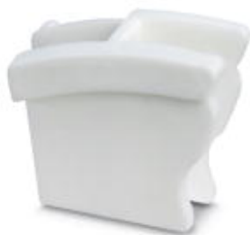
Switching lock, length: 12 mm, width: 6.2 mm, color: white

Please be informed that the data shown in this PDF Document is generated from our Online Catalog. Please find the complete data in the user's documentation. Our General Terms of Use for Downloads are valid ( http://phoenixcontact.com/download )