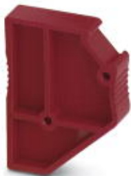
Spacer plate, length: 22.4 mm, width: 6.2 mm, height: 29 mm, number of positions: 1, color: red

Please be informed that the data shown in this PDF Document is generated from our Online Catalog. Please find the complete data in the user's documentation. Our General Terms of Use for Downloads are valid ( http://phoenixcontact.com/download )