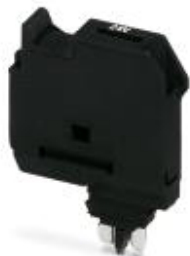
Fuse plug, fuse type: Glass / ceramics / ..., nominal current: 6.3 A, fuse type: G / 5 x 20, color: black

Please be informed that the data shown in this PDF Document is generated from our Online Catalog. Please find the complete data in the user's documentation. Our General Terms of Use for Downloads are valid ( http://phoenixcontact.com/download )