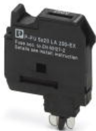
Fuse plug, fuse type: Sand filled, nominal current: 6.3 A, width: 6.2 mm, fuse type: G / 5 x 20, color: black

Please be informed that the data shown in this PDF Document is generated from our Online Catalog. Please find the complete data in the user's documentation. Our General Terms of Use for Downloads are valid ( http://phoenixcontact.com/download )