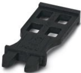
Strain relief, length: 28.9 mm, width: 9.6 mm, number of positions: 2, color: black

Please be informed that the data shown in this PDF Document is generated from our Online Catalog. Please find the complete data in the user's documentation. Our General Terms of Use for Downloads are valid ( http://phoenixcontact.com/download )