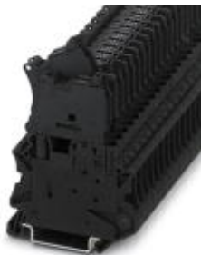
Lever-type fuse terminal block, black, for 5 x 20 mm G fuse inserts, with LED for 24 V DC

Please be informed that the data shown in this PDF Document is generated from our Online Catalog. Please find the complete data in the user's documentation. Our General Terms of Use for Downloads are valid ( http://phoenixcontact.com/download )