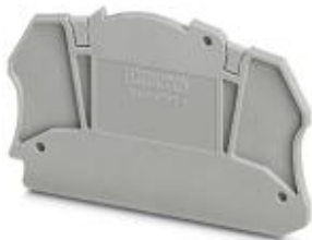
Cover, width: 2.2 mm

Please be informed that the data shown in this PDF Document is generated from our Online Catalog. Please find the complete data in the user's documentation. Our General Terms of Use for Downloads are valid ( http://phoenixcontact.com/download )