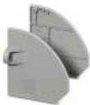
Flange cover, Color: gray