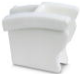
Switching lock, plug-in