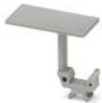
Group marker label, snaps onto terminal center for screw, spring-cage and quick connection terminal blocks, labeled with a 25 x 12 mm label or manually with the B-STIFT, in the foot part with ZB 5

Group marker label for terminal marking - GBS 5-25X12 - 0810588