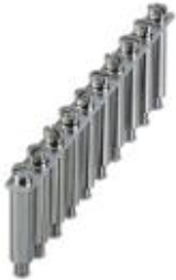
Fixed bridge, pitch: 9 mm, number of positions: 10, color: silver

Please be informed that the data shown in this PDF Document is generated from our Online Catalog. Please find the complete data in the user's documentation. Our General Terms of Use for Downloads are valid ( http://phoenixcontact.com/download )