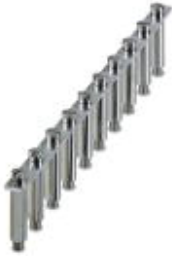
Fixed bridge, pitch: 13 mm, number of positions: 10, color: silver

Please be informed that the data shown in this PDF Document is generated from our Online Catalog. Please find the complete data in the user's documentation. Our General Terms of Use for Downloads are valid ( http://phoenixcontact.com/download )