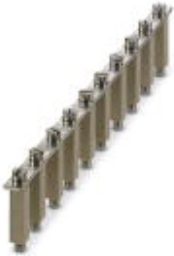
Fixed bridge, pitch: 13 mm, number of positions: 10, color: silver

Please be informed that the data shown in this PDF Document is generated from our Online Catalog. Please find the complete data in the user's documentation. Our General Terms of Use for Downloads are valid ( http://phoenixcontact.com/download )