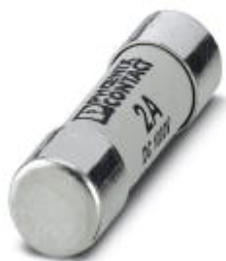
Fuse, 10.3x38 mm, up to 1000 V DC, gPV characteristics

Please be informed that the data shown in this PDF Document is generated from our Online Catalog. Please find the complete data in the user's documentation. Our General Terms of Use for Downloads are valid ( http://phoenixcontact.com/download )