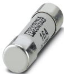
Fuse, 10.3x38 mm, up to 1000 V DC, gPV characteristics

Please be informed that the data shown in this PDF Document is generated from our Online Catalog. Please find the complete data in the user's documentation. Our General Terms of Use for Downloads are valid ( http://phoenixcontact.com/download )