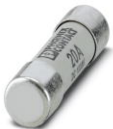
Fuse, 10.3x38 mm, up to 1000 V DC, gPV characteristics

Please be informed that the data shown in this PDF Document is generated from our Online Catalog. Please find the complete data in the user's documentation. Our General Terms of Use for Downloads are valid ( http://phoenixcontact.com/download )