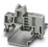
End clamp, for assembly on NS 32 or NS 35/7.5 DIN rail