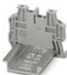
Quick mounting end clamp for NS 35/7,5 DIN rail or NS 35/15 DIN rail, can be fitted with ZB 5 and ZBF 5 zack marker strip, KLM 2, KLM3, and KML3L terminal strip marker, parking option for FBS...5, FBS...6, KSS 5, KSS 6, width: 5.15 mm, color: gray