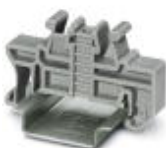
Snap-on end bracket, for 35 mm NS 35/7.5 or NS 35/15 DIN rail, can be fitted with Zack strip ZB 8 and ZB 8/27, terminal strip marker KLM 2 and KLM, width: 9.5 mm, color: gray