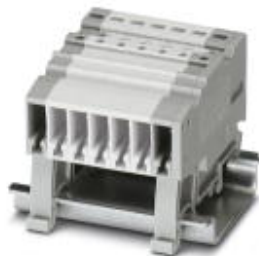
COMBI receptacle, Connection method: Push-in connection, Number of connections: 1, Number of positions: 16, Cross section: 0.14 mm 2 - 1.5 mm 2 , AWG: 26 - 14, Width: 56 mm, Height: 27.1 mm, Color: gray

Please be informed that the data shown in this PDF Document is generated from our Online Catalog. Please find the complete data in the user's documentation. Our General Terms of Use for Downloads are valid ( http://phoenixcontact.com/download )