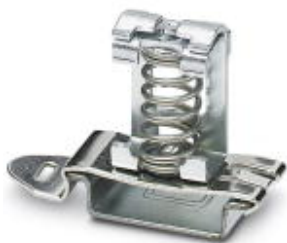
Shield connection terminal block, for applying the shield to busbars

Please be informed that the data shown in this PDF Document is generated from our Online Catalog. Please find the complete data in the user's documentation. Our General Terms of Use for Downloads are valid ( http://phoenixcontact.com/download )