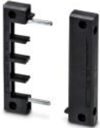
Sealing frame, Length: 120 mm, Width: 58 mm, Height: 17 mm, Color: black

Please be informed that the data shown in this PDF Document is generated from our Online Catalog. Please find the complete data in the user's documentation. Our General Terms of Use for Downloads are valid ( http://download.phoenixcontact.com )